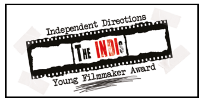
Tue 29 March, 12.30pm - 5.30pm, HPPH FREE Event