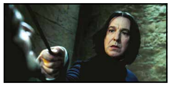
Fri 25 Mar, 10am, HPPH Dir. David Yates, UK/USA, 2009, 153 mins