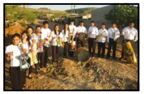
Sun 27 March, 4:30pm, HPPH PG Dir. Graham Townsley/Brad Allgood, USA/ Norway/Brazil/Paraguay, 2015, 84 mins

If life gives you lemons... you make lemonade. But if it gives you litter instead? Make music! Landfill Harmonic tells the incredible true story of a town in Paraguay that is transformed by a music teacher's genius idea to build musical instruments out of rubbish picked from the landfill nearby. He gives the oil drum violins, packing crate guitars and similar instruments to local children and a truly inspiring journey begins.