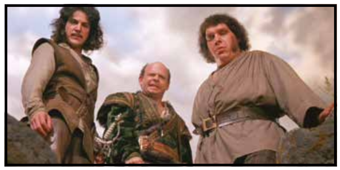
Tue 29 March, 9:30am, HPPH Dir. Rob Reiner, USA, 1987, 98 mins