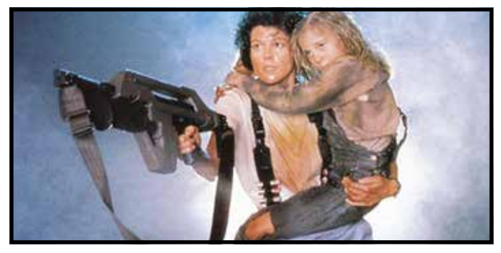
Sat 26 March, 10.30pm, HPPH Dir. James Cameron, UK/USA, 1986, 137 mins