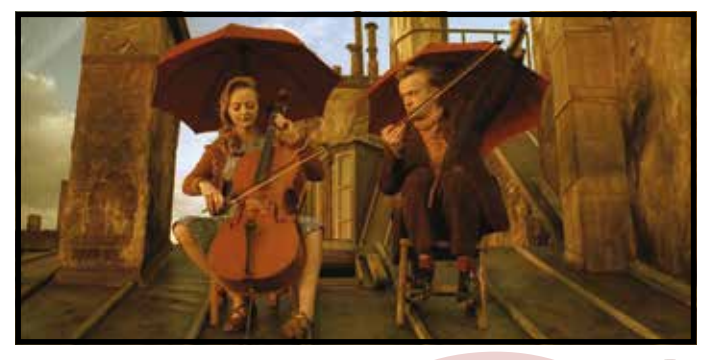
Fri 25 March, 3pm, HPPH Dir. Marc Caro/Jean-Pierre Jeunet, France, 1991, 99 mins