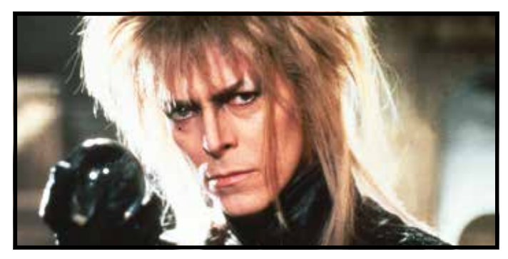
Fri 25 Mar, 1pm, HPPH Dir. Jim Henson, USA/UK, 1986, 101 mins