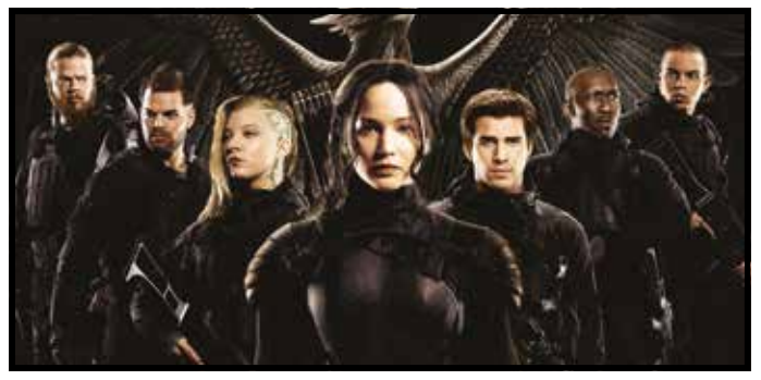
Tue 29 March, 6pm & 8.30pm, Leeds Town Hall Dir. Francis Lawrence, USA, 2014, 123 mins Dir. Francis Lawrence, USA, 2015, 137 mins